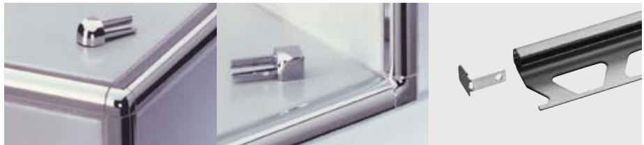
Schlüter®-RONDEC external and internal corners