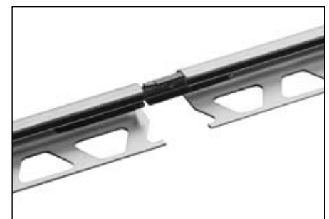
Schlüter®-RONDEC-AV (Connector for aluminium profiles)

Colours: TSB = tuscan beige aluminium, TSG = tuscan pewter aluminium, TSOB = tuscan bronze aluminium