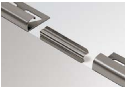
Schlüter®-RONDEC-EV (Connector for stainless steel profiles)